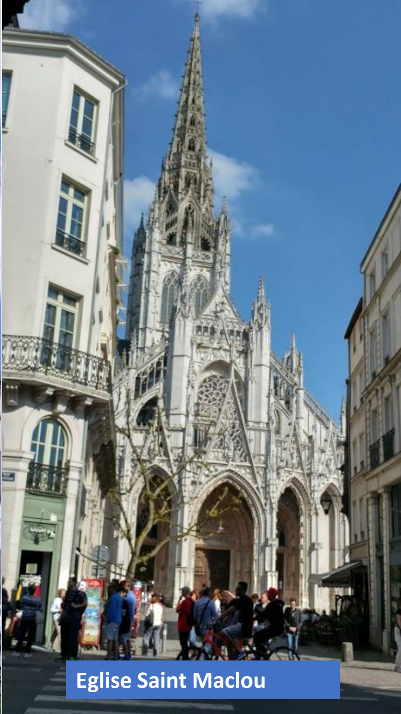
Eglise Saint Maclou