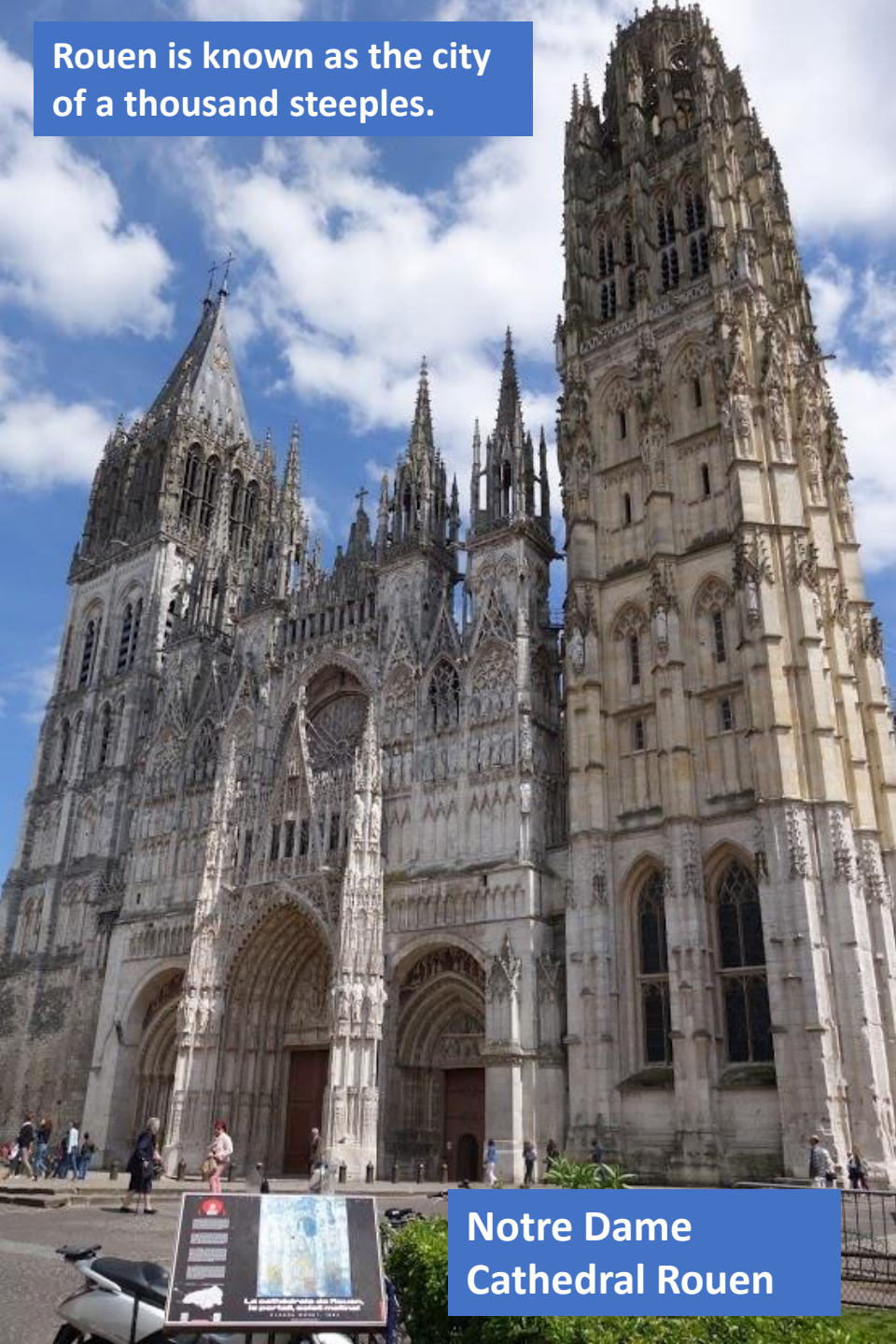
Notre Dame Cathedral Rouen

Rouen is known as the city of a thousand steeples.