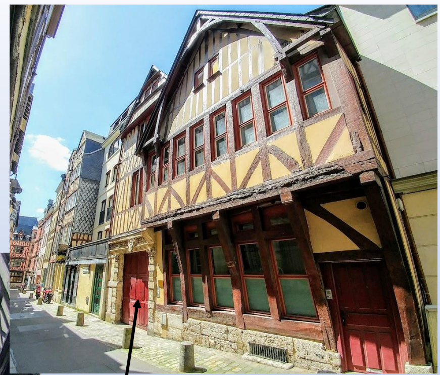
I stayed on Rue Étoupée . Access to my Airbnb was through the red door in the center of this picture.