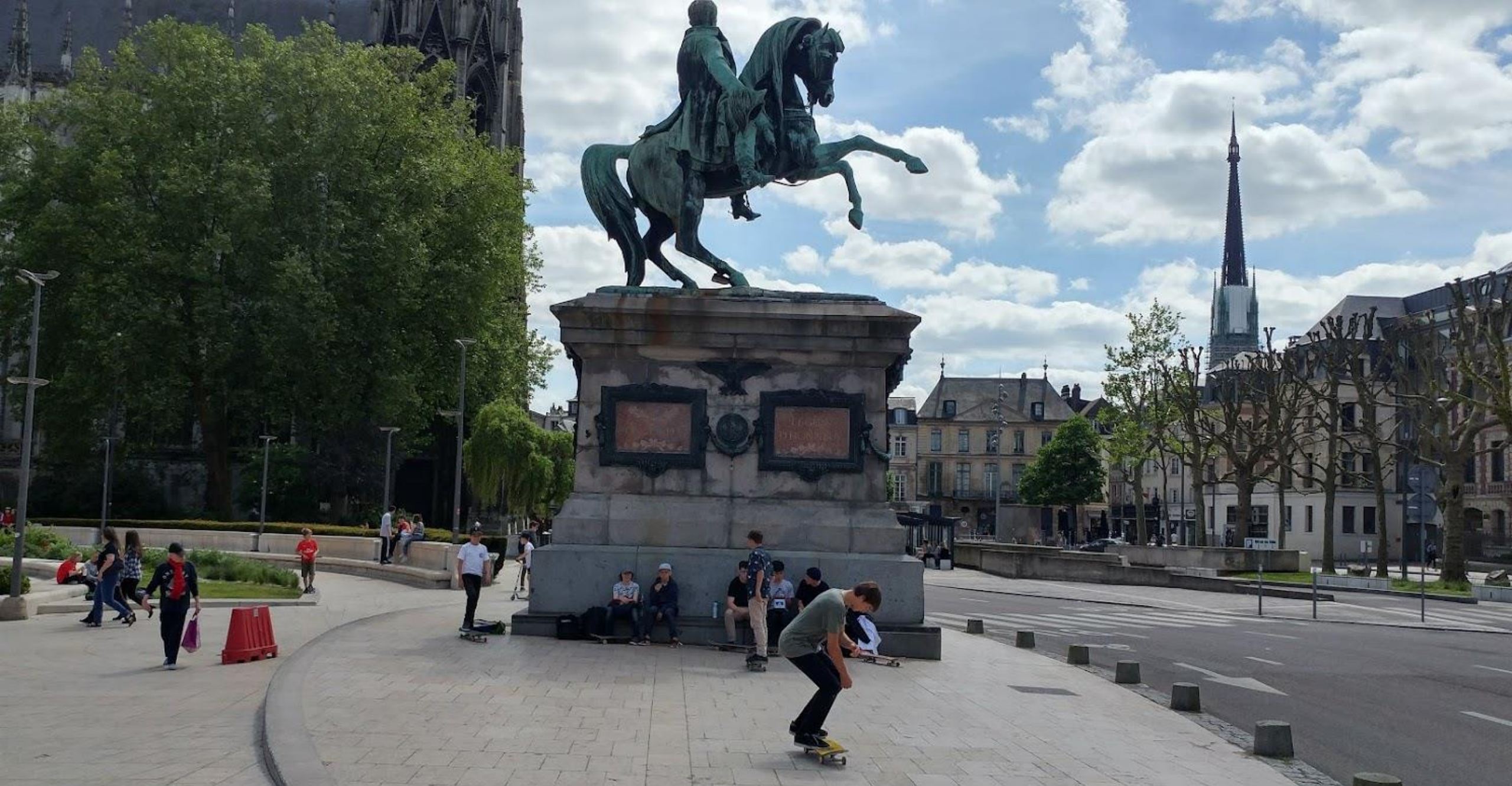
PLACE DU GENERAL DU GALLE IN FRONT OF HOTEL DE VILLE (CITY HALL)