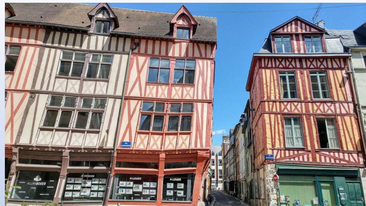
Half timbered houses typical of Normandy are abundant in Rouen